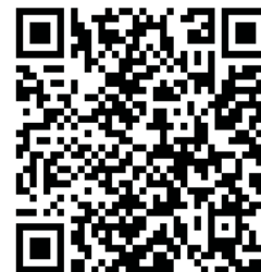
DSB Installation Sheet Delcrete with DelAgg Elastomeric Concrete System